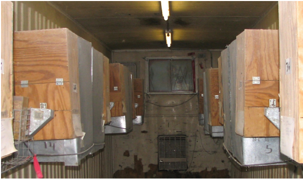
► Indoor breeding facility - birds lack fresh air, sunlight or freedom of movement.