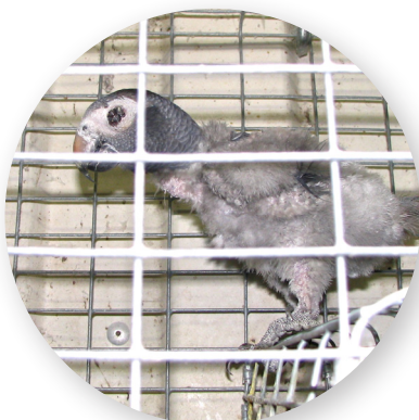
Extensive feather loss, unhealed wounds, eye damage – all signs of long-term neglect