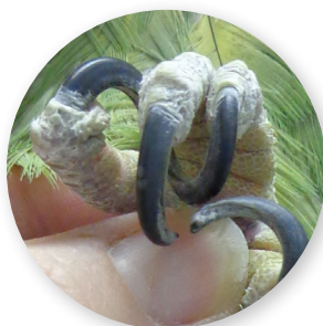
Overgrown nails and beaks