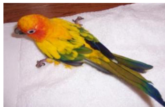
► Paresis from heavy metal poisoning