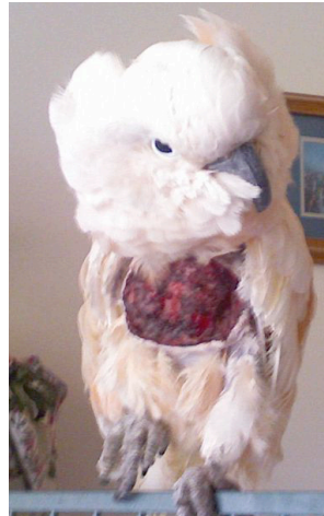
► Self-mutilating Cockatoo – immediate medical attention required