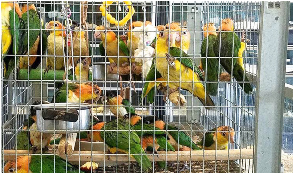
► Overcrowding in pet shop