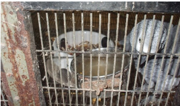
► Filthy cage, contaminated water, and lack of food