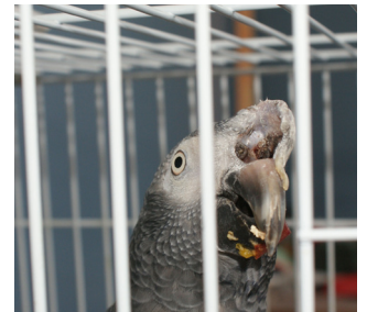
► Swollen nasal cavity, a sign of sinus infection